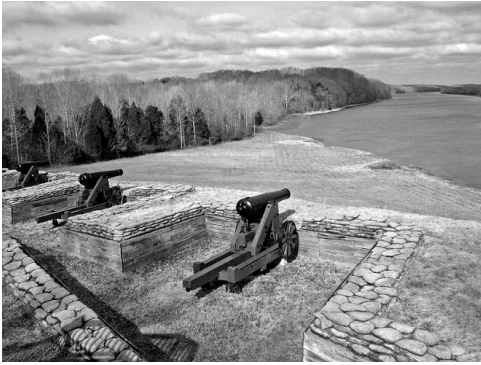
River Battery at Fort Donelson